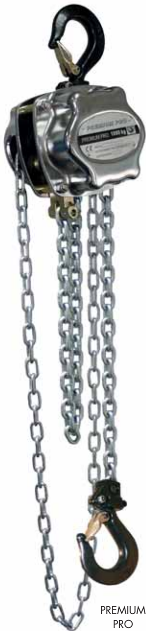
PREMIUM PRO 1 t

Thanks to the easily-accessible chain mounting, any user can insert a longer chain if required.