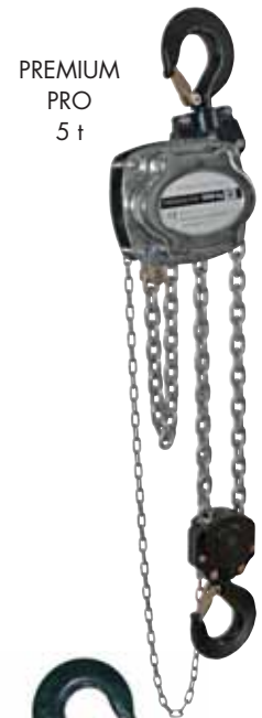
PREMIUM PRO 5 t