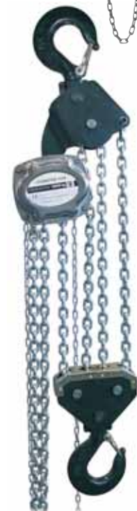
PREMIUM PRO 10 t