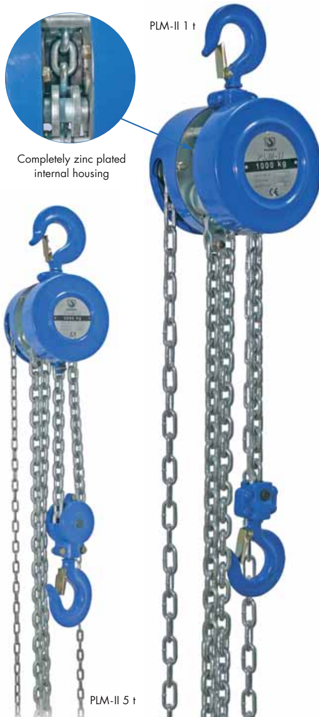
Completely zinc plated internal housing