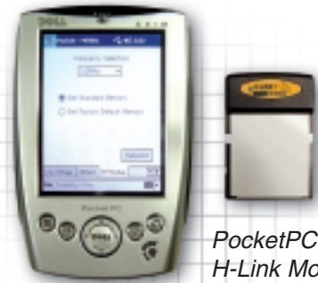
PocketPC with H-Link Modem

The MFS feature enables up to 20 transmitters to be operated in close proximity while sharing the same frequency. Therefore, operators don't have to worry about frequency management.