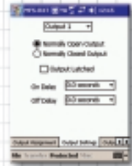
Screenshot- H-Link Software