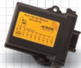
MFSHL DC-8 Receiver