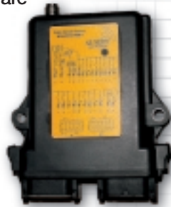
MFSHL DC-16 Receiver