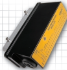
MFSHL AC-16 Receiver